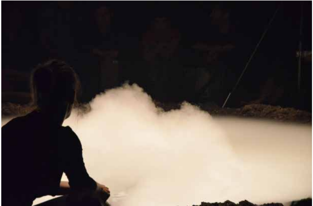
Cratère n°6899 Kunstenfestivaldesarts 2016